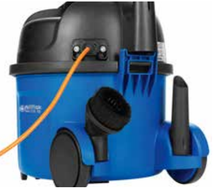
Storage for nozzles allow all the tools you need to be within easy reach at all times