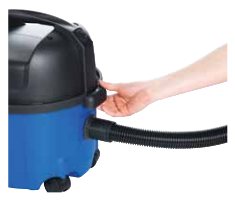
The robust latch system makes it easy to open for changing the dust bag