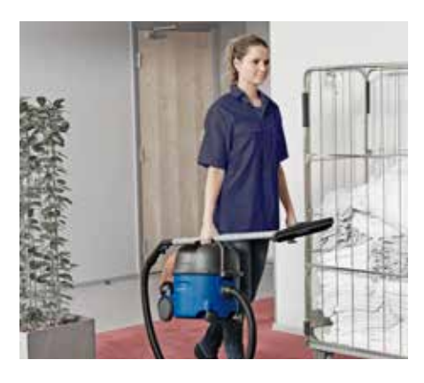
The entire machine, including wand and hose, can be carried safely and comfortable in one hand.

To help with easy maintenance and to maximise safety, an orange detachable power cord is included as standard.