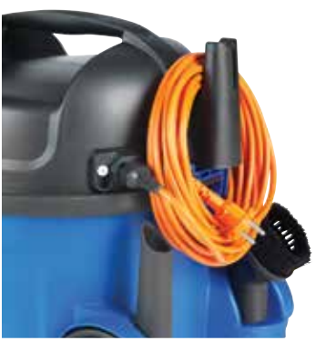
Detachable orange cord and cord hook for controlled storage