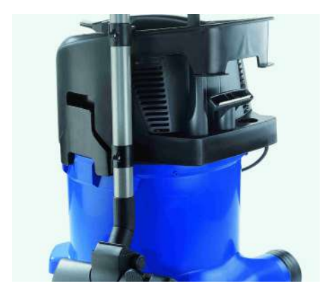
Tube storage, with hook and clip secures a good fit to the machine.

The perfect solution for everyone who needs a high quality compact industrial vacuum cleaner!