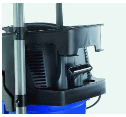
The design lets you have your accessories on hand in a secure way.