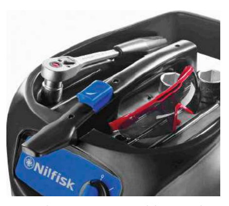
Improved accessory storage, tool deposit and container volume.