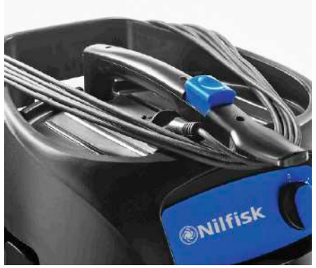
The ergonomic and sturdy grip allows one hand cable rewinding and cable storage.