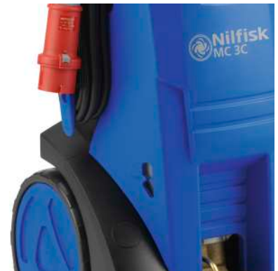
The turnable cable hook makes winding and unwinding of the electrical cable child's play.