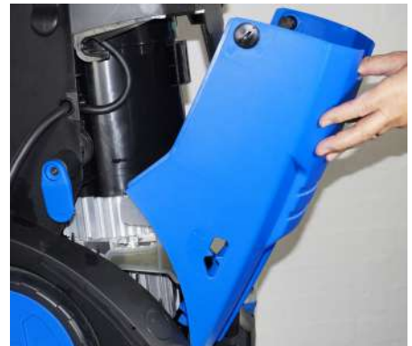
Cabinet can be removed quickly for direct access to the motor pump.