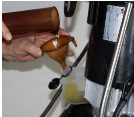
Pump oil tank with oil level sight and fill/empty function.

Some machines in the MC 3C range include this FoamSprayer technology, which allows a simple and efficient application of detergent. If not included it can be bought as an optional accessory.