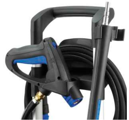
Unique patented Spray Gun Holder protects the gun from falling on the ground and being dragged behind the machine – preventing damage.

MC 3C is designed for light, general cleaning tasks and is the ideal choice for tradesmen, small building companies, small garages and farms.